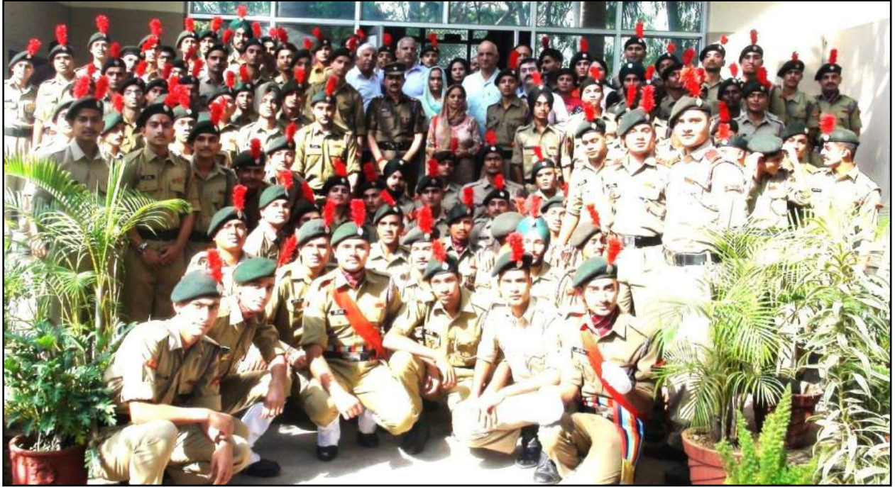
College Celebrating Martyr Day 25/10/17