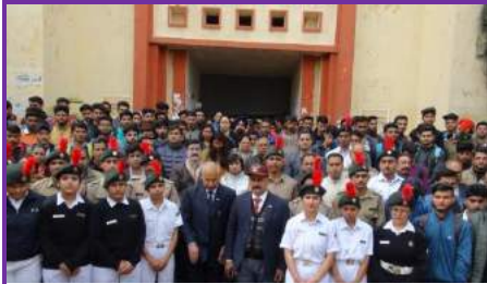
Students and the staff of the College lighting candles as a tribute to the martyrs Pulwama and Kulgam Martyrs of the Country

T ribute were paid to the Pulwama and Kulgam martyrs who gave supreme sacrifice of their lives on 14-02-2019 and 24-02-2019 respectively, defending our country, by the students (NCC, NSS