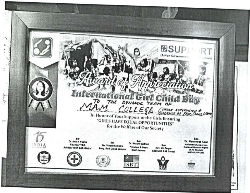
(Award of appreciation on international Girl Child Day)