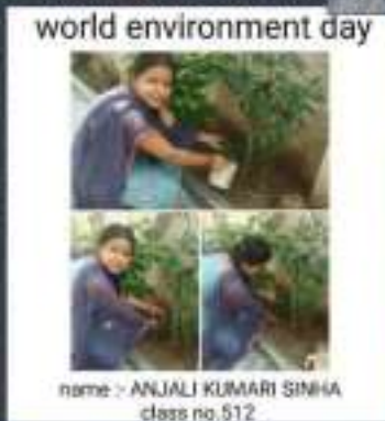
world environment day