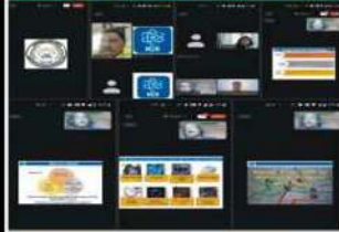
یو بی اے ورچوئل کیریئر کونسلنگ کیمپ کے شرکاء کی تصویر

لازوال ڈیسک یو بی اے ورچوئل کیریئر کونسلنگ کیمپ کے شرکاء کی تصویر یو بی اے ورچوئل کیریئر کونسلنگ کیمپ کے شرکاء کی تصویر یو بی اے ورچوئل کیریئر کونسلنگ کیمپ کے شرکاء کی تصویر