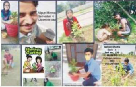
اور تصاویر کی شکل میں اپنے پروگرام میں پیش کیا۔

وہابی امور کے دوران ماحولیات کی اہمیت اور بحالی کے عنوان پر طلباء کے مابین تحریری مقابلہ