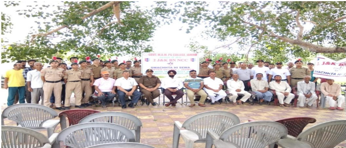
Early Times Report

NCC Cadets of NCC 2 ND Battalion of the college visited village Jaswan block Marh, Jammu for Cleanliness drive / Awareness programme Under SWACHH BHARAT MISSION