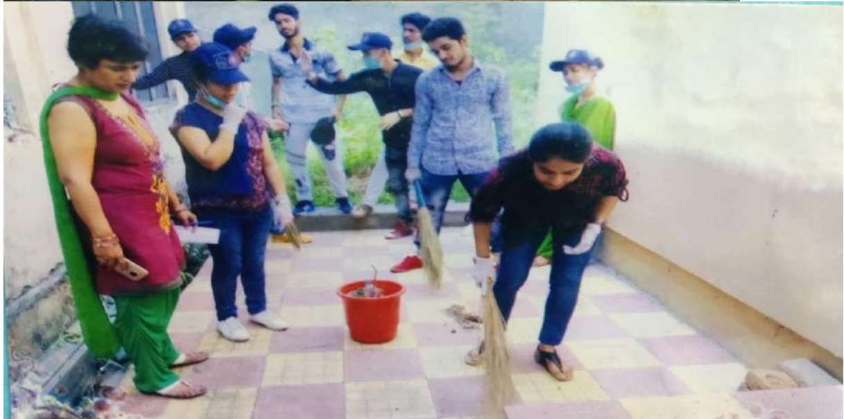
(Various photographs showing different activities of NSS Volunteers of Gov